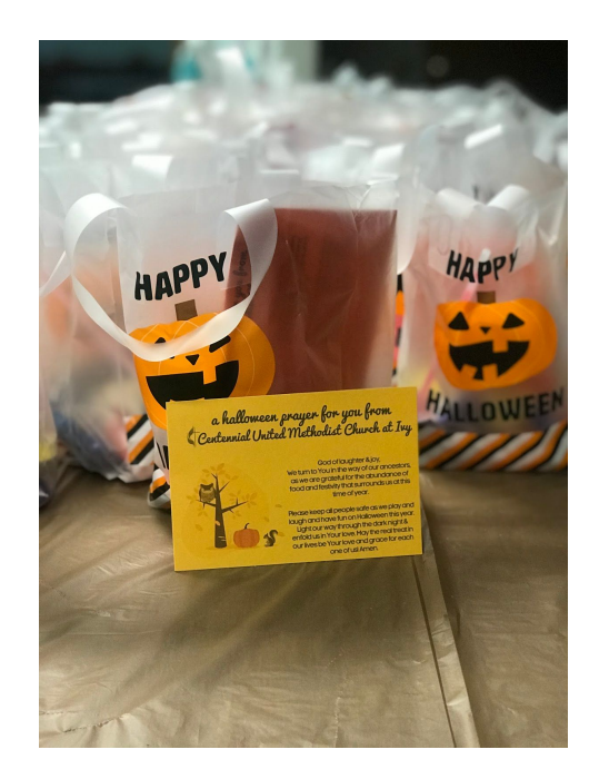
This is how the miracle continued this year at Centennial UMC at Ivy